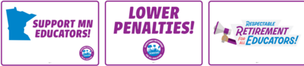
Printed signs that will be available at the Pension Rally.