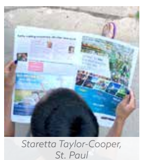
Thank an educator!

Every year, thousands of kids and adults thank educators who were influential in their lives at Education Minnesota's State Fair booth. We will feature a selection in each issue of the Minnesota Educator. Keep an eye out for your name!