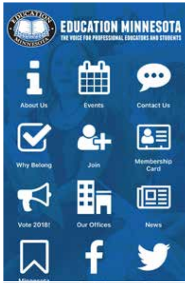
The home screen of the app allows users to easily interact with their union.